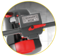
Simple soft-touch controls