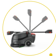
Folding handle for storage and transport