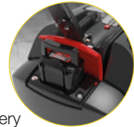
Easy battery change