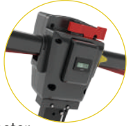
On-board hours meter ensuring optimal performance